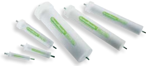
GraceResolv™ Cartridges – Luer Endfittings