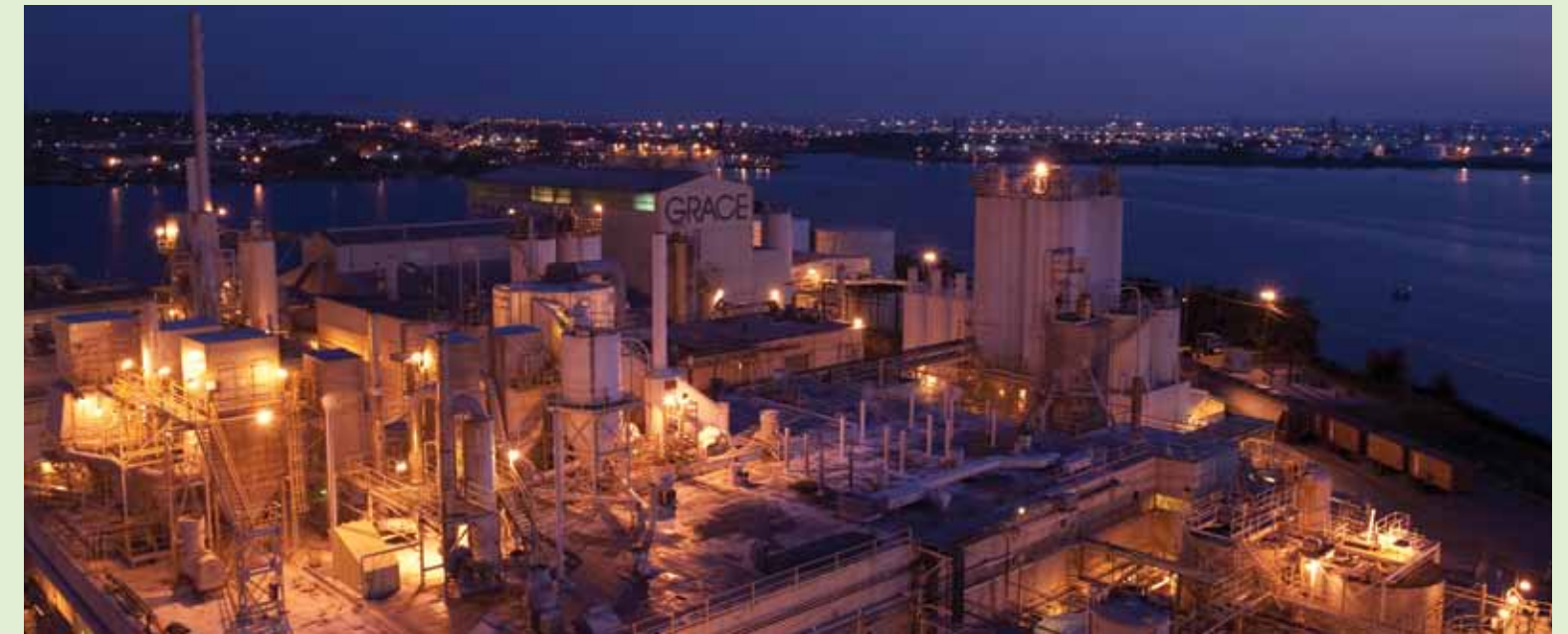
Baltimore USA Facility

Grace became the first company to receive the IPEA excipient GMP certification. Talk to us to find out how choosing Syloid® FP excipients and working with Grace can help you meet your Quality by Design (QbD) goals.